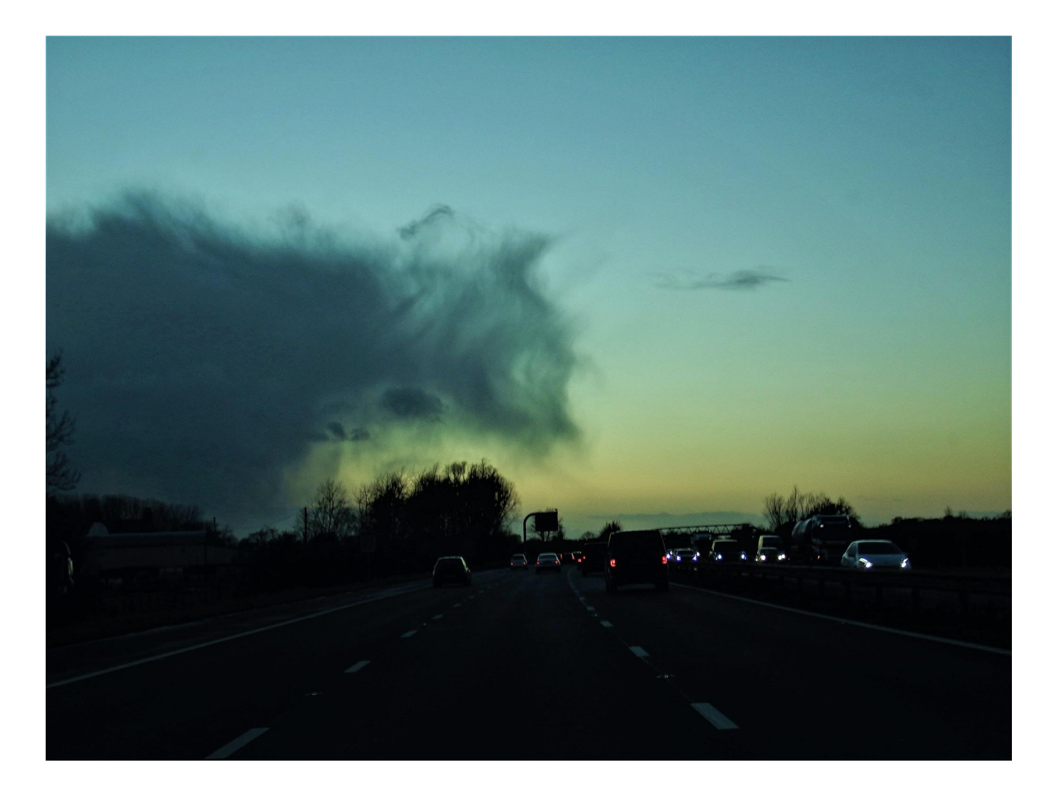
A cat Spotted over Ashtead, Surrey, England by Debbie Whatt (Member 43,013)